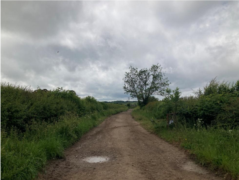
Plate 28 - The spire of St Michael and All Angels Church is visible to the left and the ridge line of a building becomes visible.