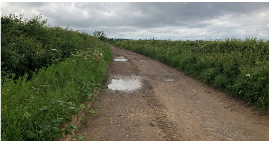
Plate 24 - Views start to look more south, but there are still not views of the village or its Conservation Area