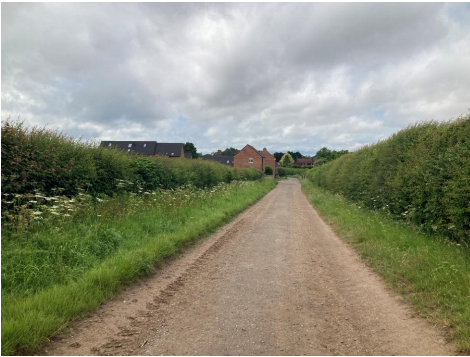
Plate 332 – Views encluse to Old Hall Court as one approaches the village.