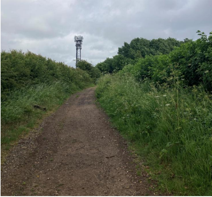
Plate 12 - The north eastern edge of Hyams Lane looking north east towards the Travelodge site. Tower visible above the tree line.