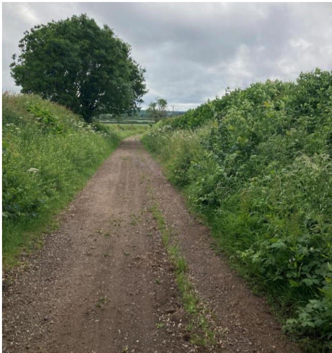
Plate 17 - Further along the lane as the lane travels down the incline views open up to the south west in the direction of Diseworth, only the fields to the east of the village are visible, some of which form the application Site.