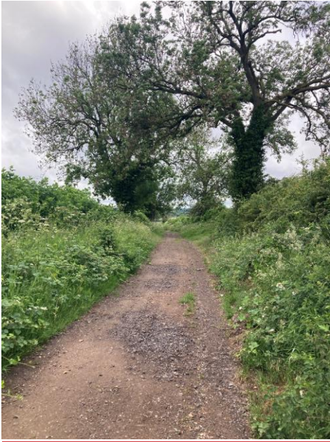
Plate 16 - As one travels up the incline views to the north become visible over the hedge line.