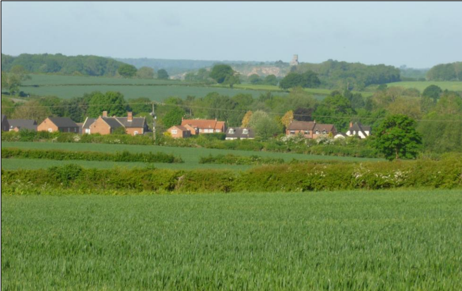
Plate 1: Church of St Mary and St Hardulph, Breedon-on-the-Hill viewed from the north-western portion of the EMG2 Main Site with housing on the north end of Grimes Gate, Diseworth in the foreground.