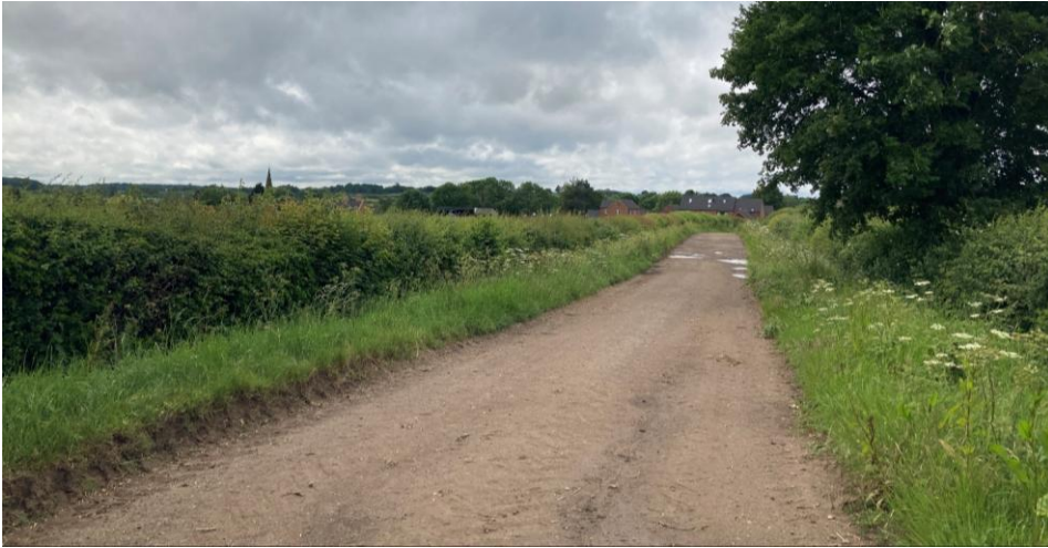
Plate 32 – More built form become visible, this is mainly modern development of Old Hall Court, a single traditional building is visible and St Michael and All Angels is visible, only the spire still.