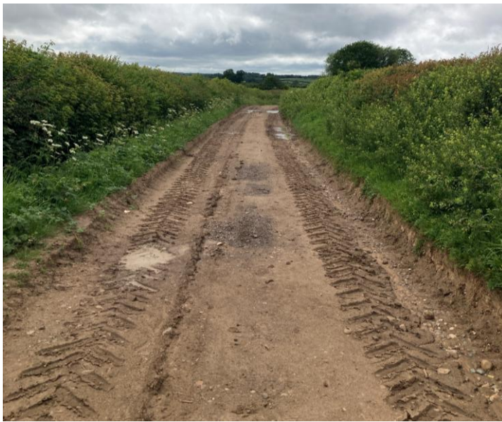
Plate 21 - Views to the south and east of the village, the Site forms the foreground