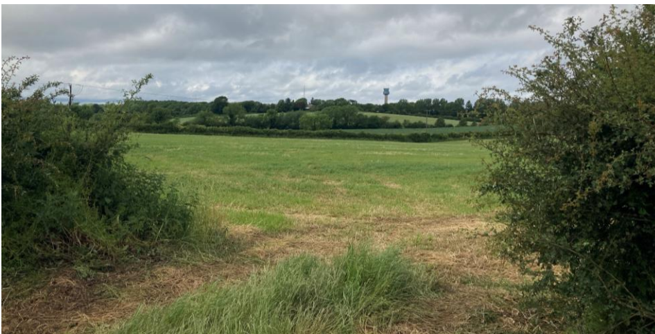
Plate 29 - View to the north, the Airport tower is more prominent.