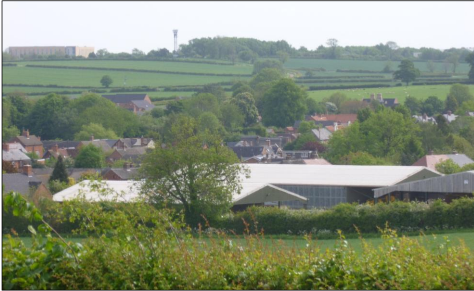
Plate 7: View from the southwest of Diseworth showing the EMG2 Main Site with a backdrop of built form at the eastern end of the East Midlands Airport.