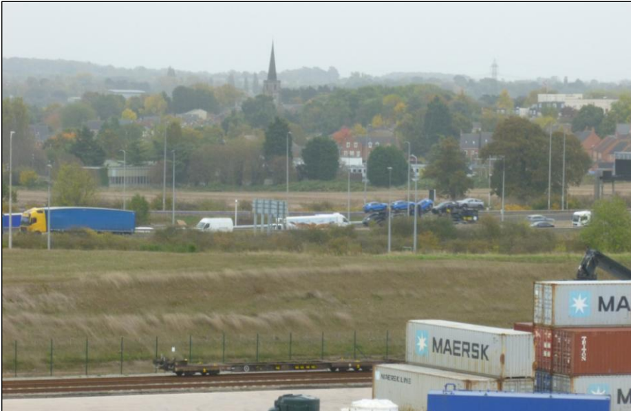
Plate 11: View of tower and spire of Church of St Andrew, Kegworth from bund to northwest of EMG1 Works.