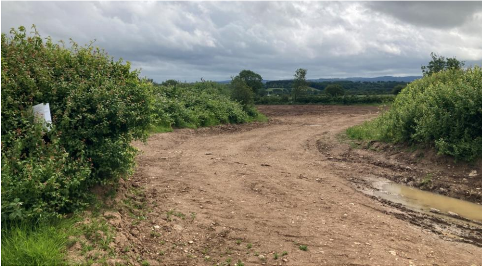
Plate 20 - Views south through an opening in the hedge. The Green (road) and street lighting associated with it are visible