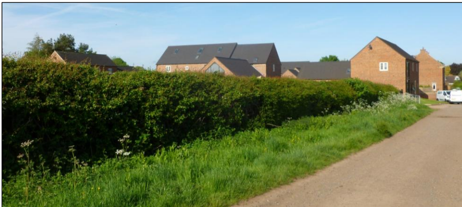
Plate 8: View of new residential development at Old Hall Court, at the northern end of Diseworth, from Hyam's Lane.