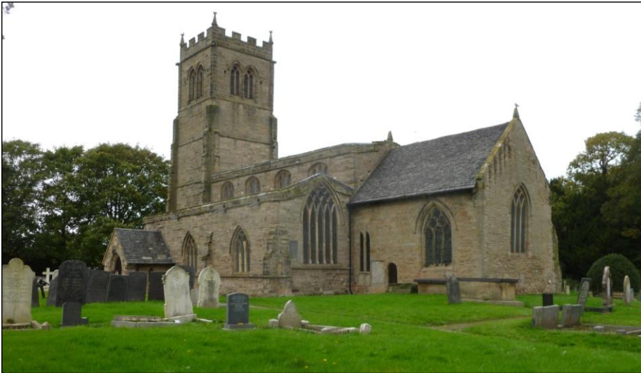
Plate 9: Church of St Nicholas, Lockington.