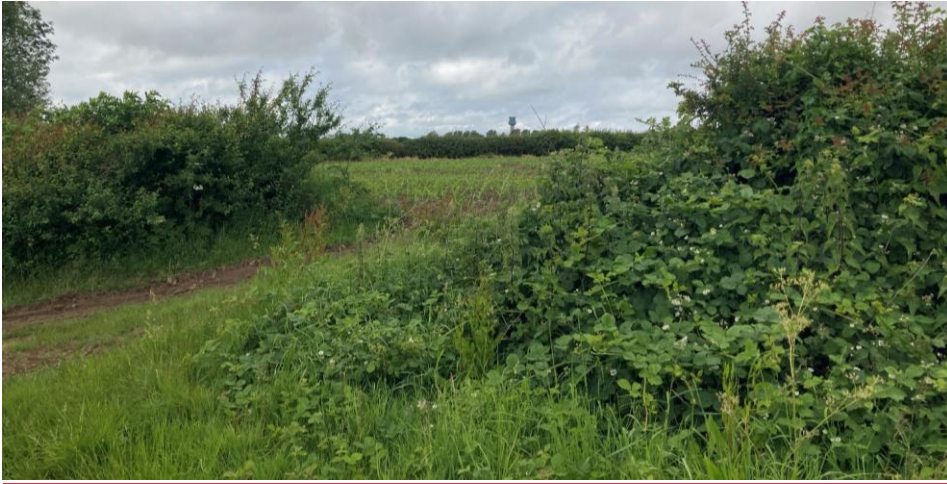
Plate 22 - Further along the lane a gap in hedgeline to the north provides a view north towards East Midlands Airport, the airport tower is visible