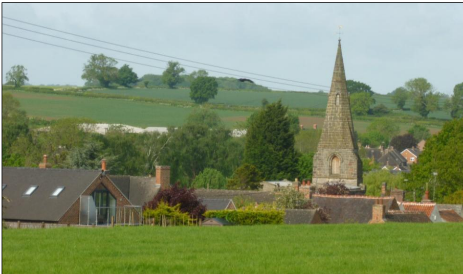
Plate 6: View of the spire of the Church of St Michael and All Angels from the south-western edge of the EMG2 Main Site.