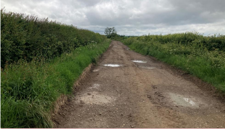
Plate 26 - Fields to the east, beyond the village are visible but views of the village are hindered by topography and vegetation.