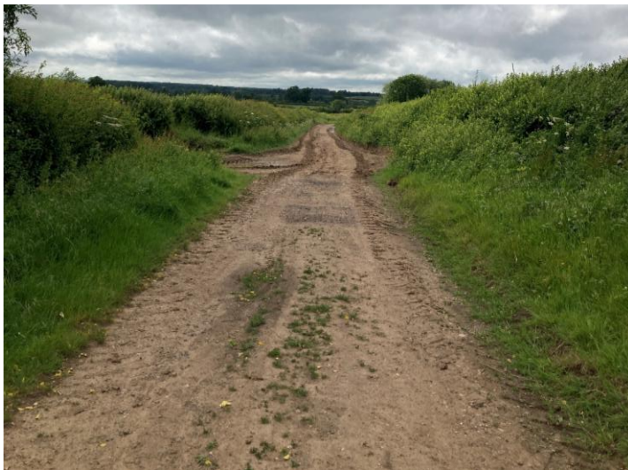
Plate 19 - Views towards the rural fields to the east of the village continue. There are no views of the Village or its Conservation Area