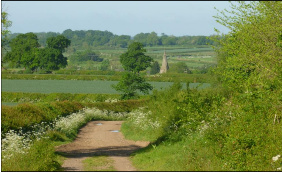
Plate 5: View of the spire of the Church of St Michael and All Angels from an upper part of Hyam's Lane.