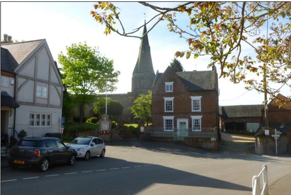
Plate 4: View of the Church of St Michael and All Angels from the north (Grimes Gate within Diseworth).