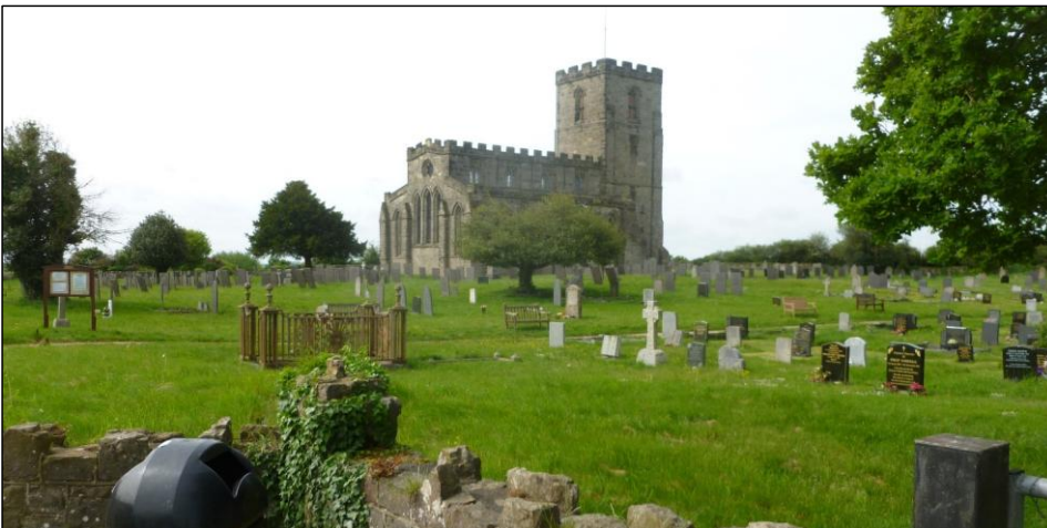
Plate 2: Church of St Mary and St Hardulph, Breedon-on-the-Hill.