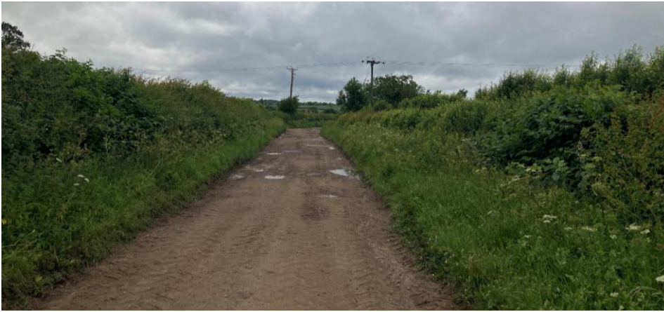
Plate 30 - St Michael and All Angels Church is less visible and the chimneys of the building are only visible.