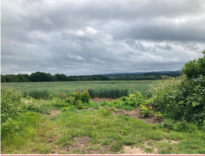
Plate 15 - Looking south from a gap in the hedge, the M1 is viable and experienced