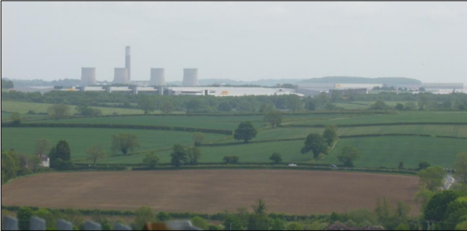
Plate 3: View northeast from the Church of St Mary and St Hardulph showing the western end of the East Midland Airport and Donnington Park with the Ratcliffe-on-Soar power station behind.