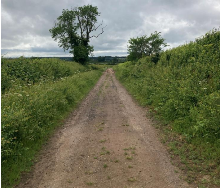
Plate18 - Views towards the rural fields to the east of the village. The immediate field forms part of the Site. There are no views of the Village or its Conservation Area