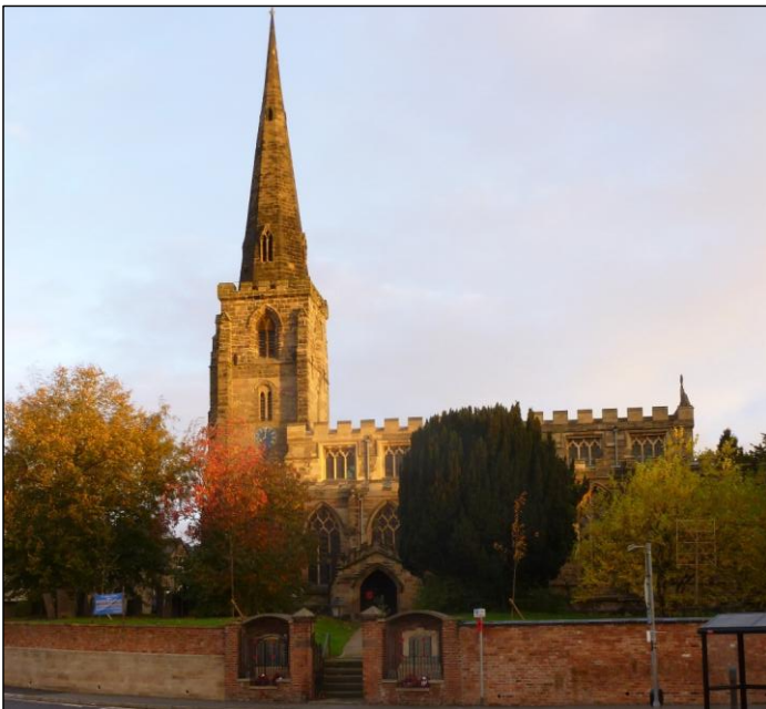
Plate 10: Church of St Andrew, Kegworth