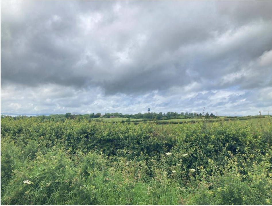
Plate 25 View north towards towards East Midlands Airport, the airport tower is visible