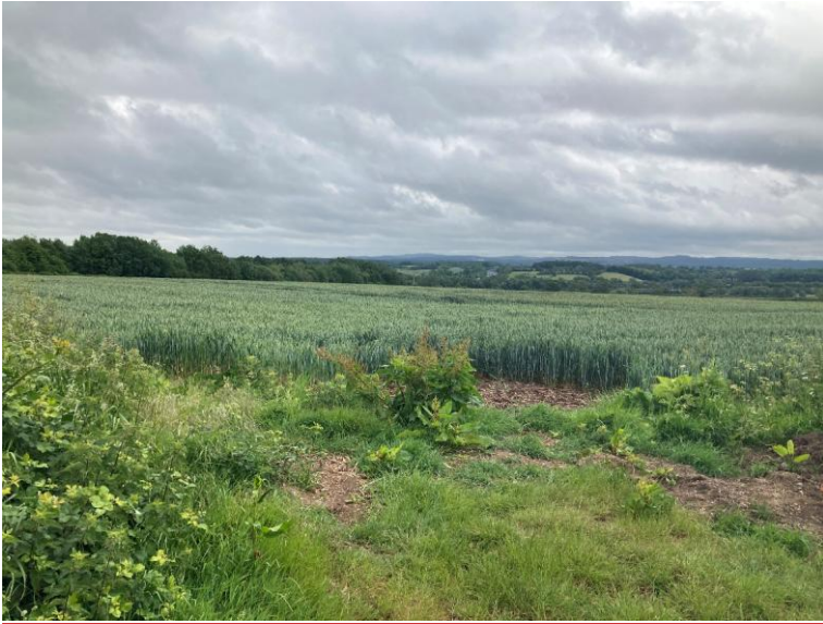
Plate 13 - View south east to the M1 and the Green