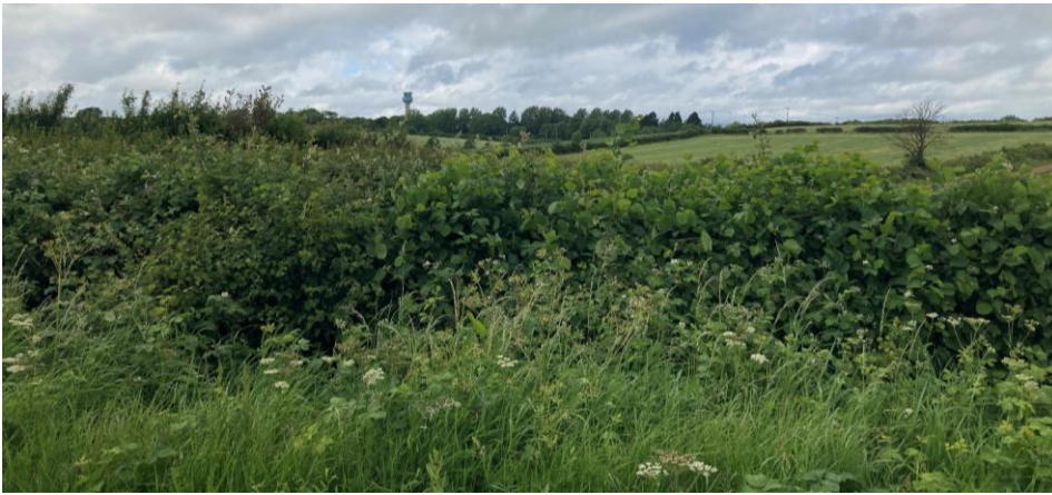
Plate 27 - View to the north, the Airport tower is more prominent.