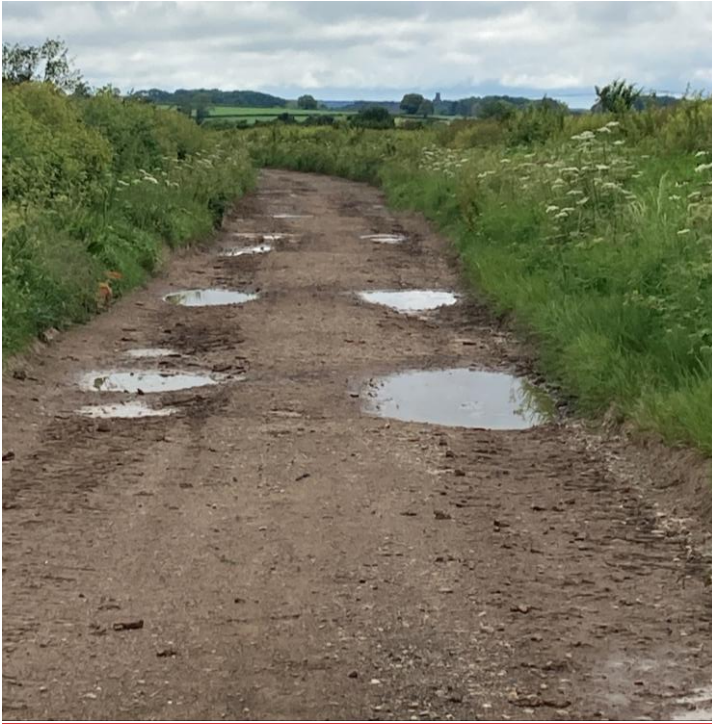
Plate 23 - As the lane meanders views are orientated to the west, north of Diseworth, the Church of St Mary and St Hardulph at Breedon in the Hill is visible in the distance