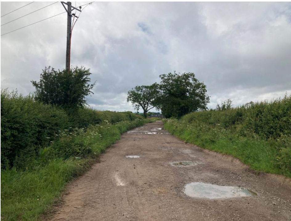
Plate 31 - Telephone lines visible, the roof line of recent housing of Old Hall Court is visible, blocking views of the Conservaiton Area.